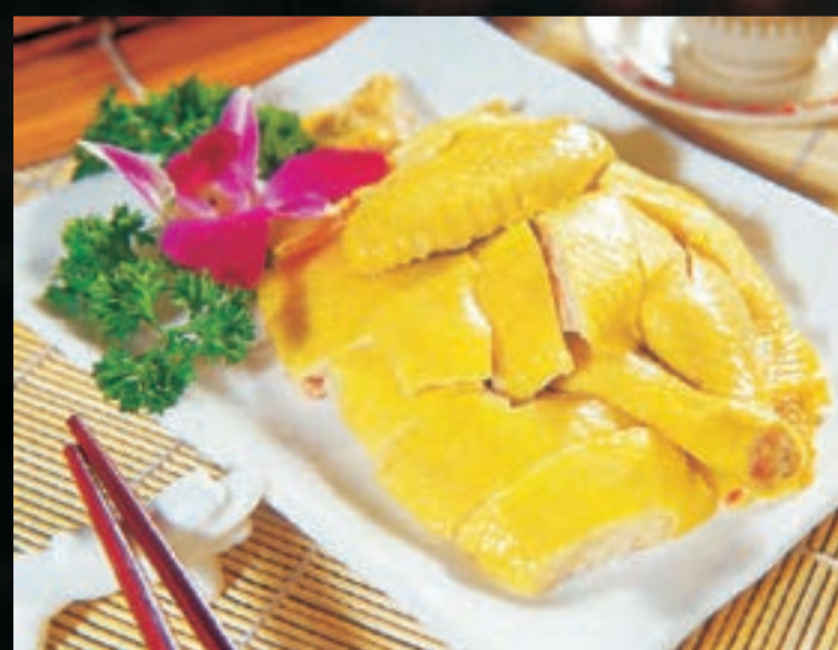
白切雞, 紅蔥雞 (Half Bird) $34.80 White Cut Chicken with Ginger & Spring Onion/Shallot Sauce

時菜雞球 $32.00 Stir Fried Chicken with Vegetables