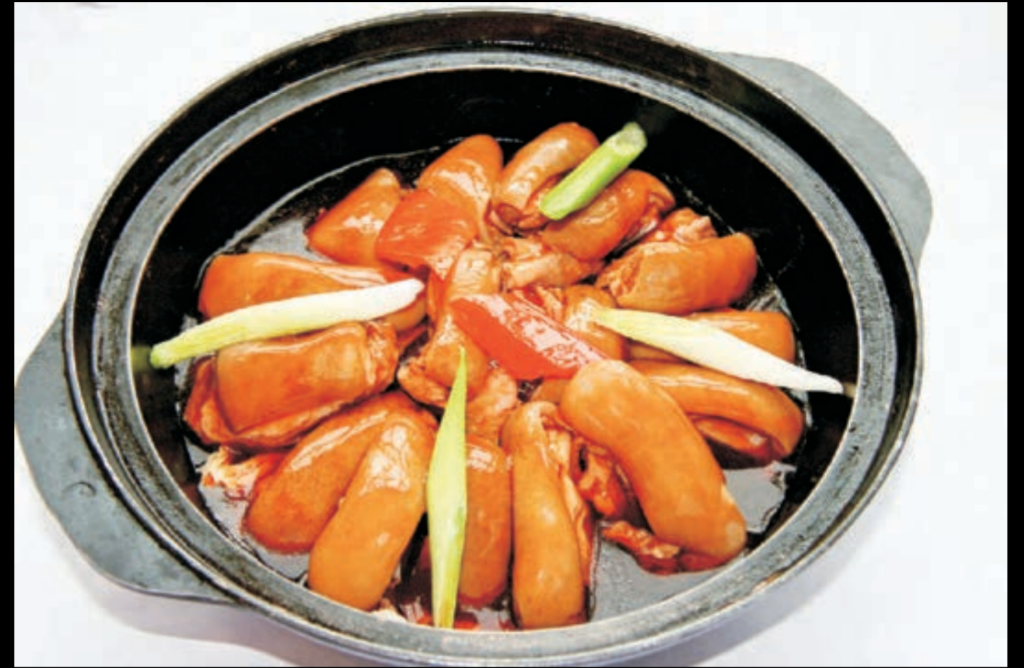
支竹羊腩煲 $38.00 Lamb Casserole with Bean Curd Stick