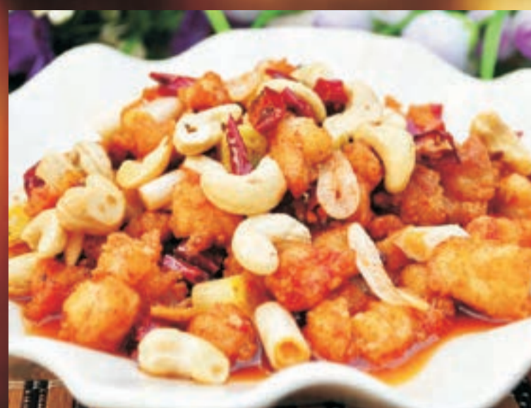
腰果雞丁 $28.00 Chicken Cashew Nuts in Basket