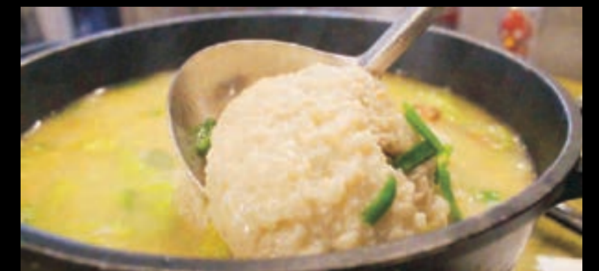
清湯獅子頭 $38.80 Braised Meatballs in Vegetable Casserole

● 图片仅供参考，出品以实物为准。Pictures are representative and are for reference only