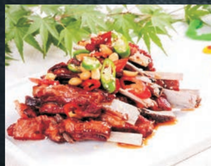
黑椒羊架 $48.00 Lamb Rack with Black Pepper Sauce

黑椒牛柳 $42.00 Fillet Steak with Black Pepper Sauce