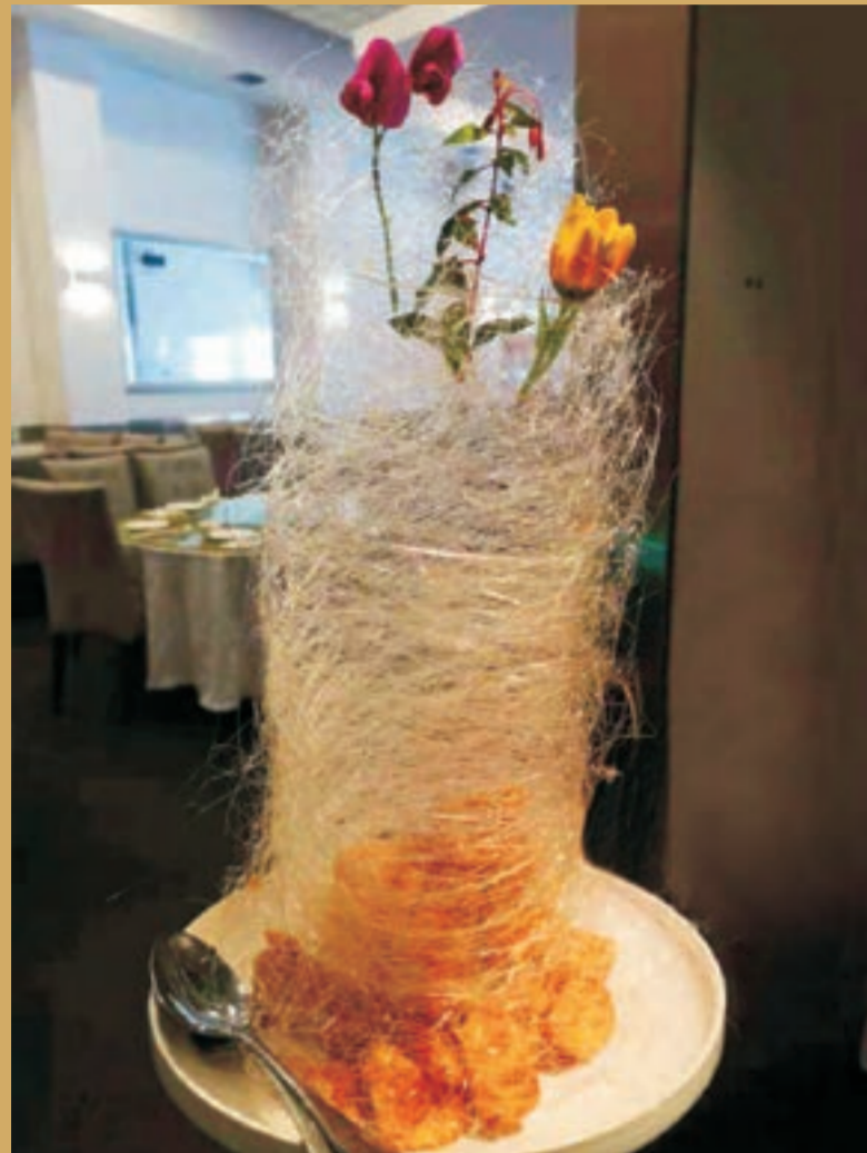
拔絲地瓜 $28.00 Crispy Toffee Kumara