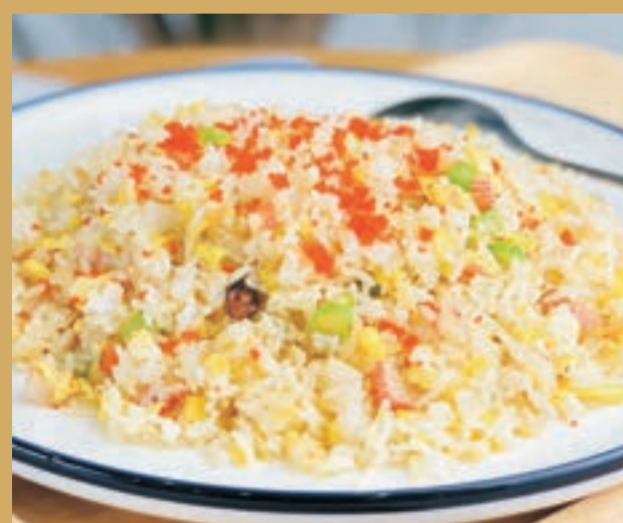
菜心炒飯 $24.00 Vegetable Fried Rice

辣菜牛肉炒飯 $26.00 Beef Fried Rice with Pickle