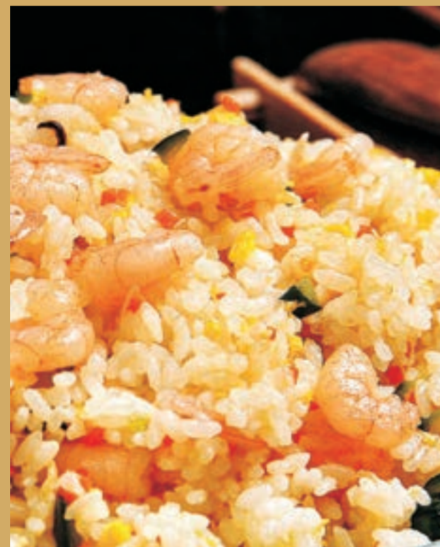
蝦仁菜心炒飯 $28.00 Shrimp Fried Rice

廣東臘腸炒飯 $28.80 Special Cantonese Sausage Fried Rice