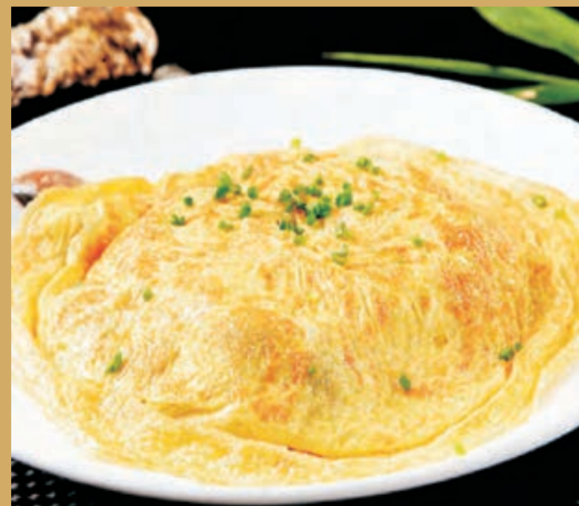
什錦芙蓉 $32.00 Combination Fu Yong

● 图片仅供参考，出品以实物为准。Pictures are representative and are for reference only