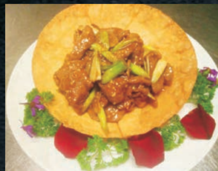
少炒黃牛肉 $38.00 Spicy Beef with Ginger & Coriander