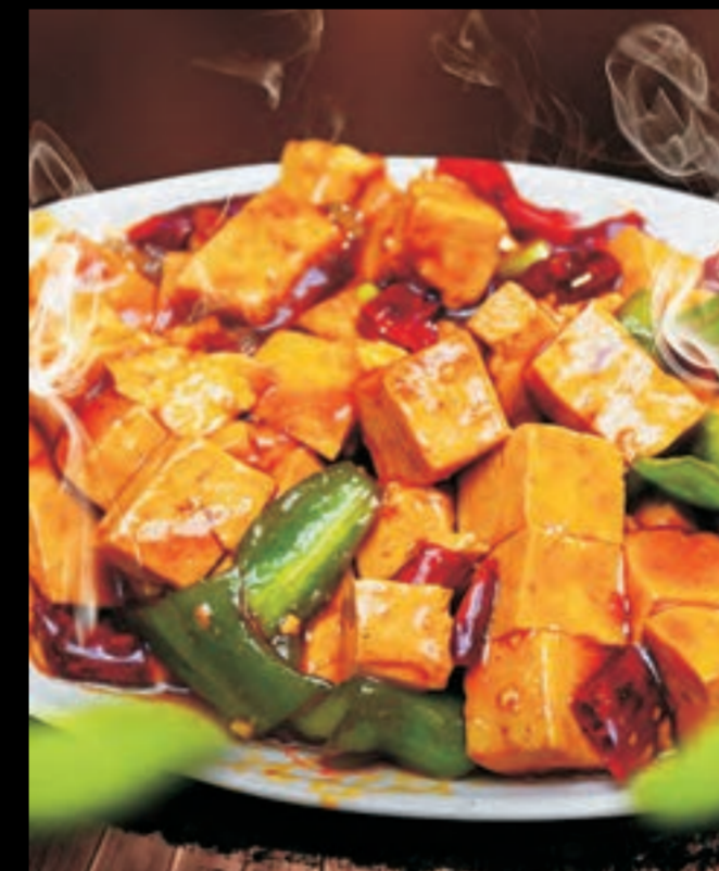
紅燒豆腐 $28.00 Stir Fried Seasonal Vegetables with Tofu

燒汁茄子 $32.00 Deep Fried Eggplant with Teriyaki Sauce