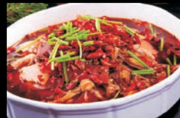
毛血旺 $54.00 Chong Qing Style Boiled Duck Blood Curd in Chilli Oil