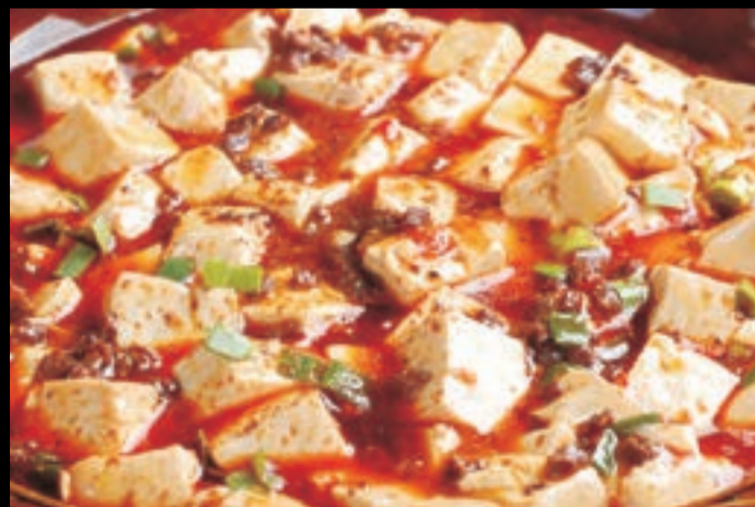
麻婆豆腐 $28.00 Ma Po Tofu