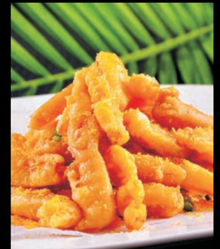
金沙南瓜 $28.80 Deep Fried Pumpkin with Salted Egg Yolk