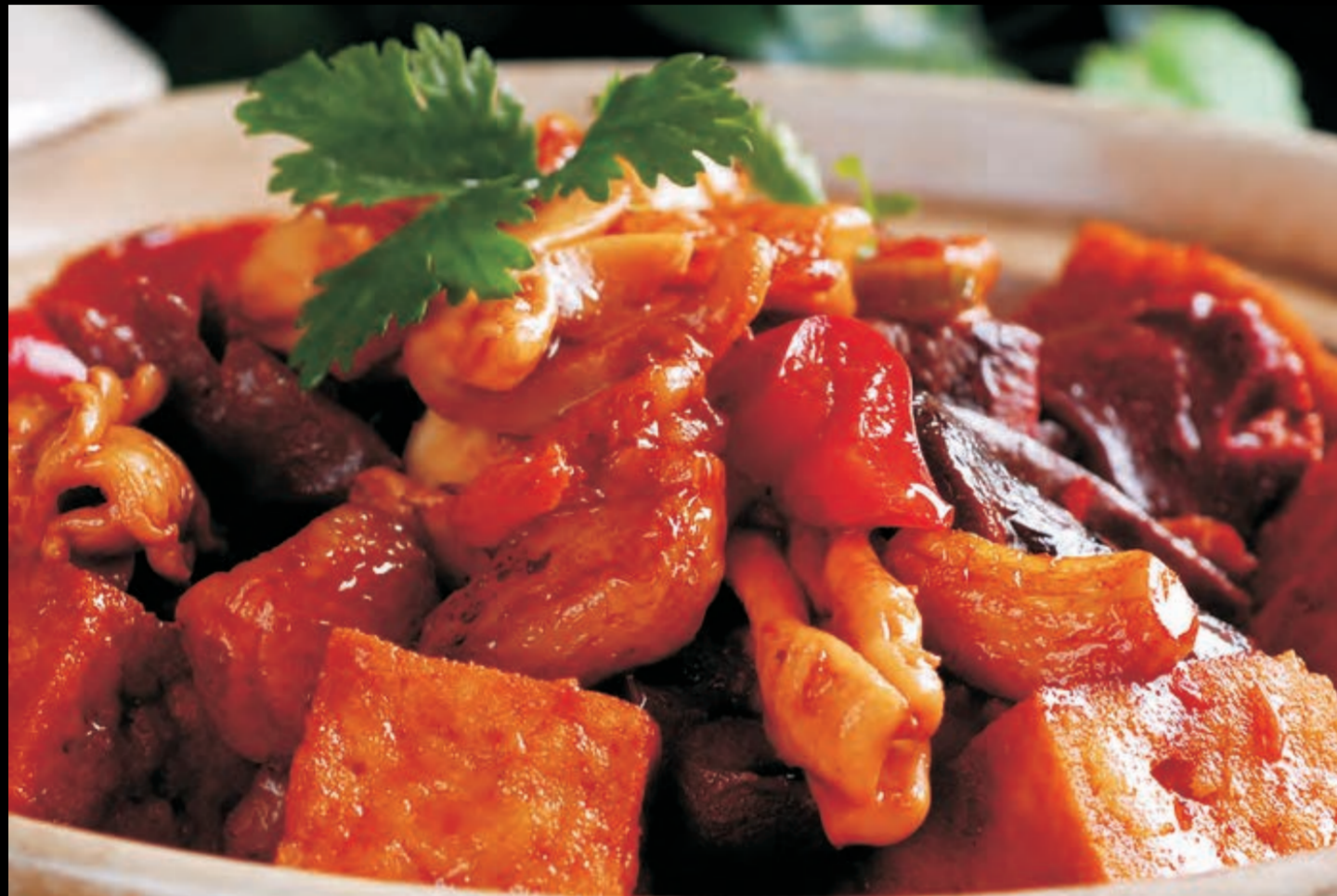
八珍豆腐煲 $38.00 Combination Meat with Bean Curd