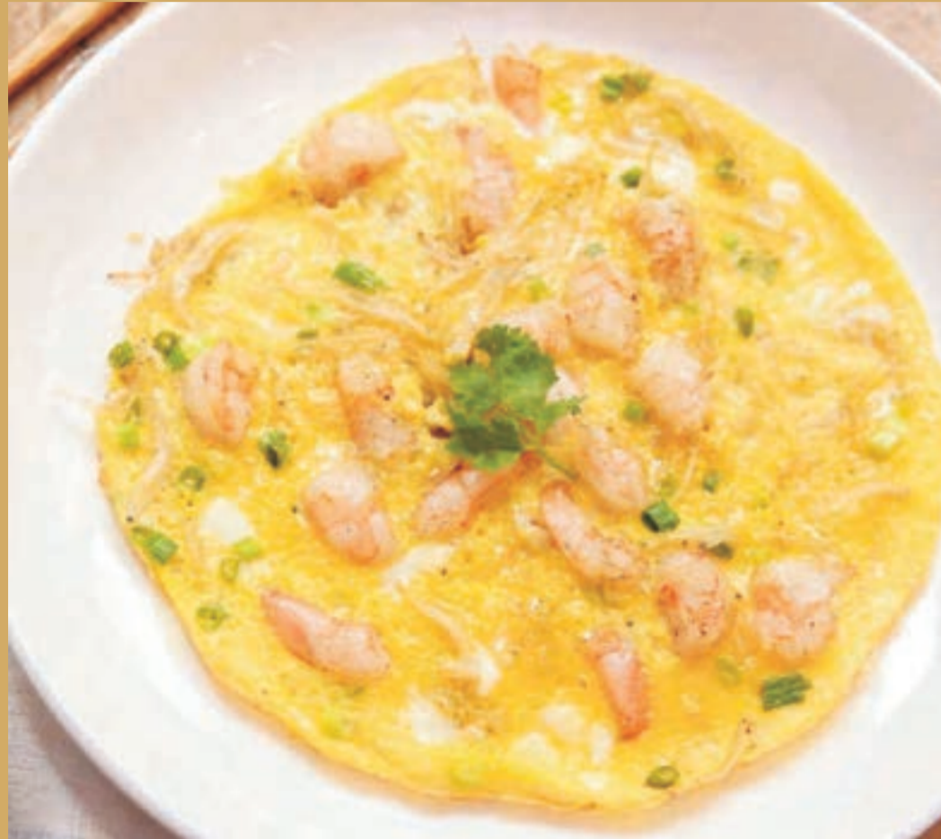
蝦仁芙蓉 $36.00 Shrimp Egg Fu Yong