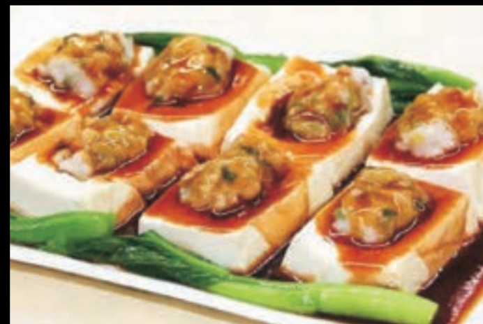
百花蒸釀豆腐 $38.00 Steamed Tofu Stuffed with Minced Prawn

酸辣豆腐 $26.00 Deep Fried Tofu with Pickled Vegetables